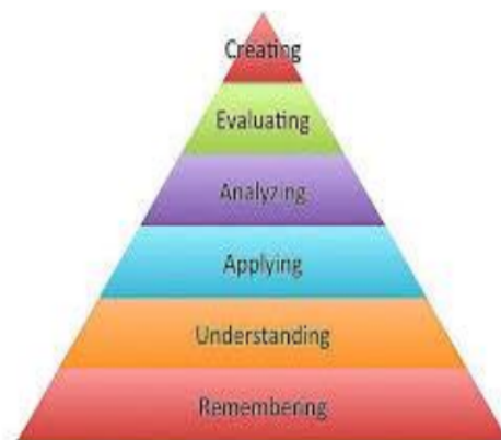
Figure 2: Taxonomy Bloom's model

Independently, while the teacher functions as control of the activities carried out by students (Carbaugh & Doubet, 2014). Bergmann, J. & Sams, (2012) created an inverted classroom shape to describe a learning model that combines hands-on learning with a constructivist learning experience. This model provides an opportunity to bring more natural technology into the classroom and explore more creative ways to engage students in learning (Smaldino et al., 2016).