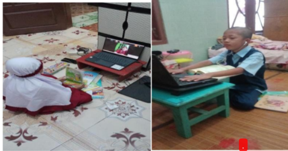
Figure 2. Character of student independence in online learning

students because they do not interact with their teachers cause a less obedient attitude from students, based on information that researchers got from several schools in the city of Sumenep, during this pandemic. many students experience changes in their character and behavior, even more so to their own teachers, there are students who ignore online assignments given by their teachers, even though there are those who do not read WA Group messages regarding the assignments given and some of them leave. from their class WA group, the most troubling problem for teachers at the school were students who resisted when reminded not to spam chat groups, even when reprimanded the students said inappropriate words to their teacher and caused the teacher to be offended and to disappointed.