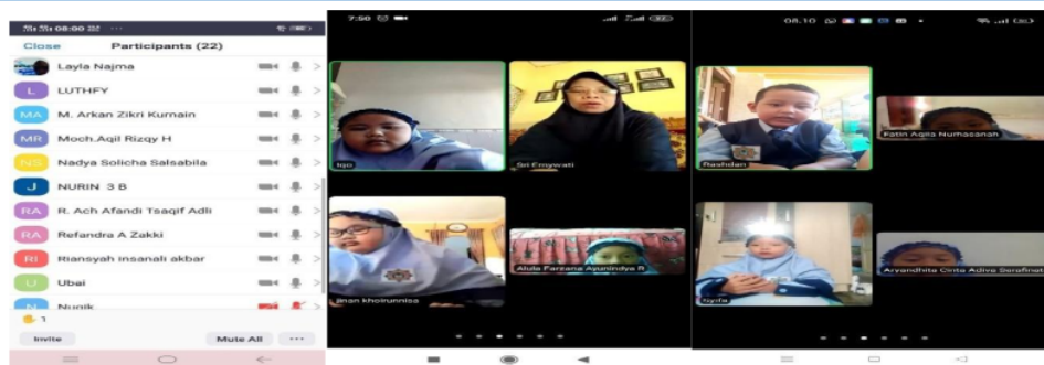
Figure 3. Online learning in Pandemic

The implementation of online learning activities can run smoothly and there is good cooperation between schools and parents. Responsibility is an attitude that arises after what has been done or done, aware of what must be done from all obligations. The teacher gives structured assignments to students in accordance with the lesson plans, with supervision in accordance with the plans that the teacher has done previously, the teacher can be responsible for all actions taken.